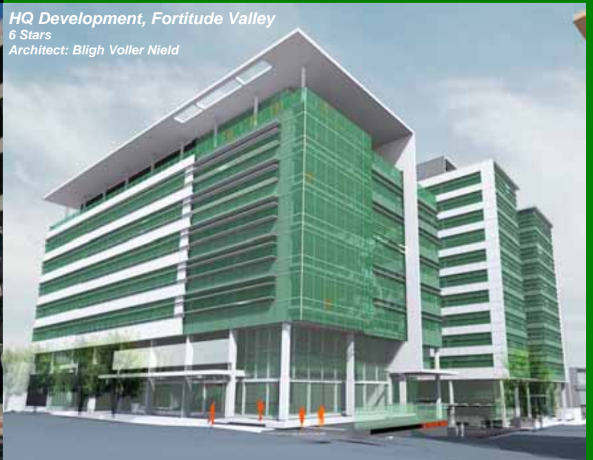
HQ Development, Fortitude Valley 6 Stars Architect: Bligh Voller Nield